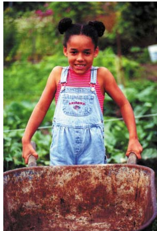
Capital District Community Gardens.